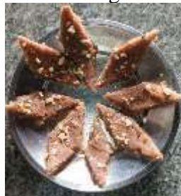
Fig: 2 PROSO-MILLET MILK BURFI