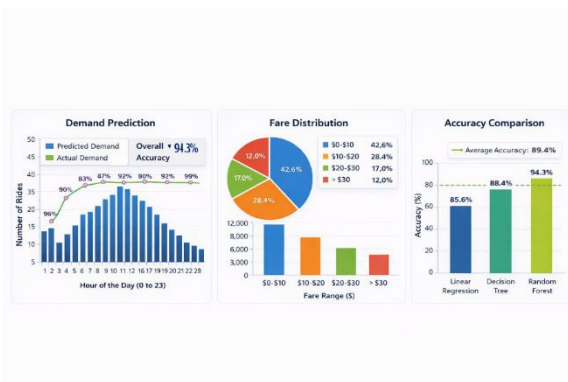
Fig 2: uber data analysis result

The experimental results demonstrate that machine learning models effectively analyze Uber data. Demand prediction accuracy improves significantly compared to traditional methods. Random Forest achieves higher accuracy than linear regression. Peak demand hours and high-traffic zones are clearly identified. Fare trends show a strong correlation with distance and time. Visualizations provide clear insights into ride patterns. The results validate the effectiveness of feature engineering and model selection. The system performs well on large datasets.